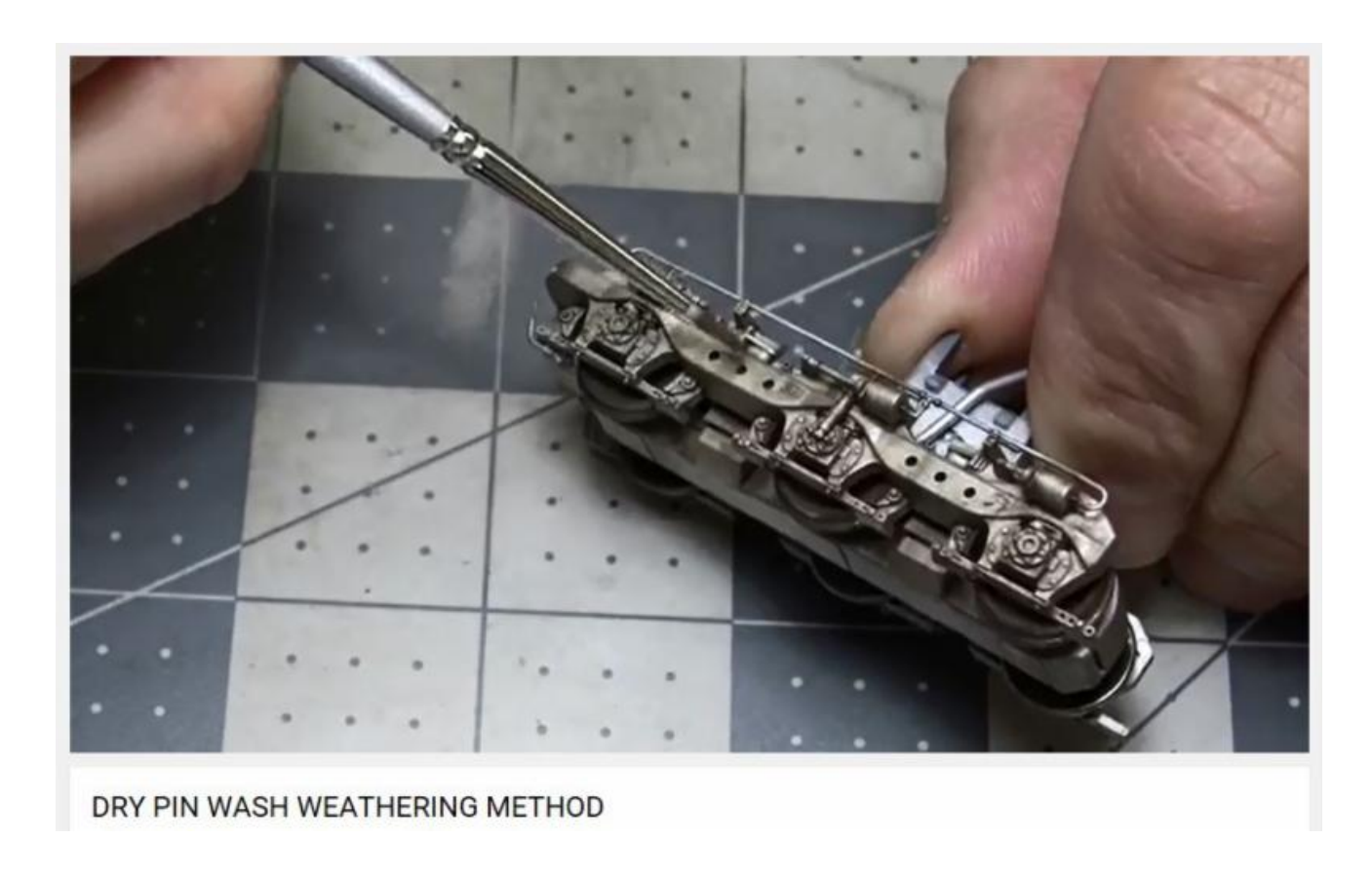
Dry Pin Wash Weathering

The presenter uses pigments to produce what he calls a Dry Pin Wash.