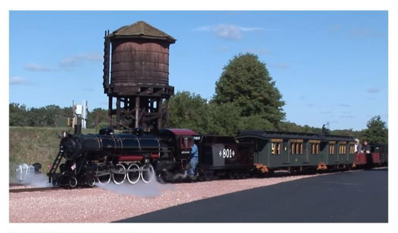
"Backyard" Railroading on a Grand Scale

A look at Lance Mindheim's "Downtown Miami Spur" layout.