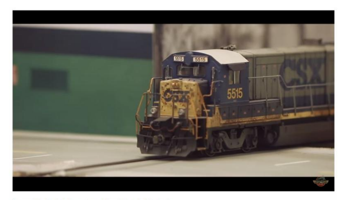
Lance Mindheim's Downtown Miami Spur in HO Scale