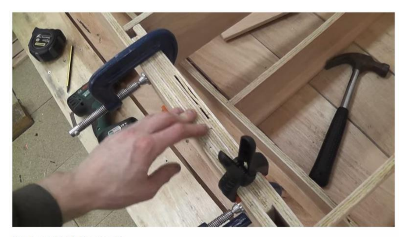
New Layout Build - Baseboards