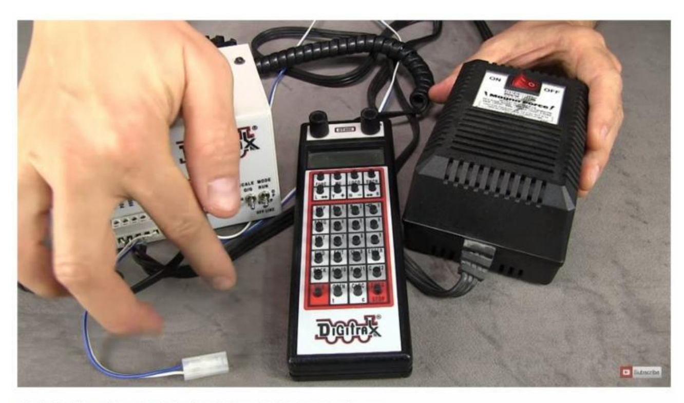
Model Railroading 101 Episode 3 DC and DCC For Beginners

This e-publication is a collection of railroad and model railroad videos, podcasts, websites, and/or other information freely available on the internet that we think may be of interest to you. The NMRA claims no ownership of this information, nor do we endorse its creators or their websites. The NMRA Turntable will not promote individuals or their for-profit ventures.